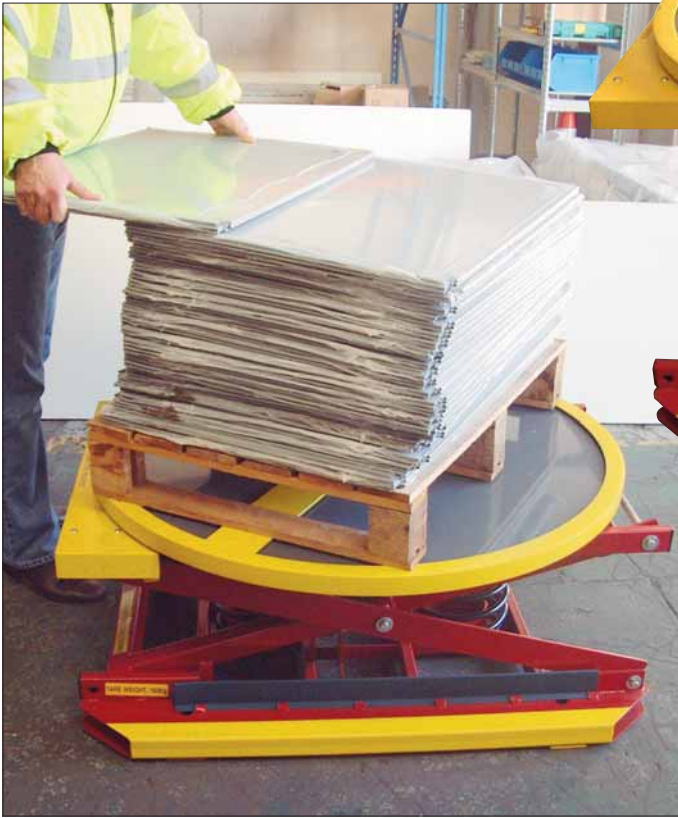
WPPPALS: Spring Work Positioner