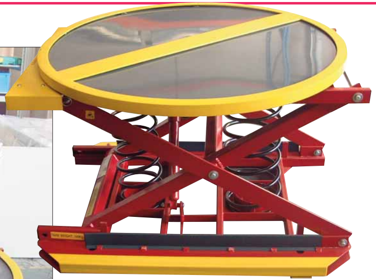
WPPPALS: Spring Work Positioner